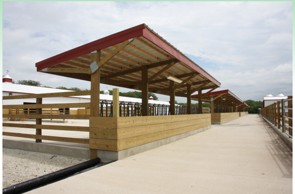
Pictured Above: The Heifer Barn at Cutting Edge Genetics

To learn more about Cutting Edge Genetics, visit their breeder page at HolsteinPlaza.com/Cutting-Edge-Genetics .