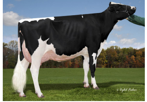
Cookiecutter DTA Habitan

5. OCD Gameday Mint 55880 Gameday x Rome x Jedi +3110 GTPI Oakfield Corners