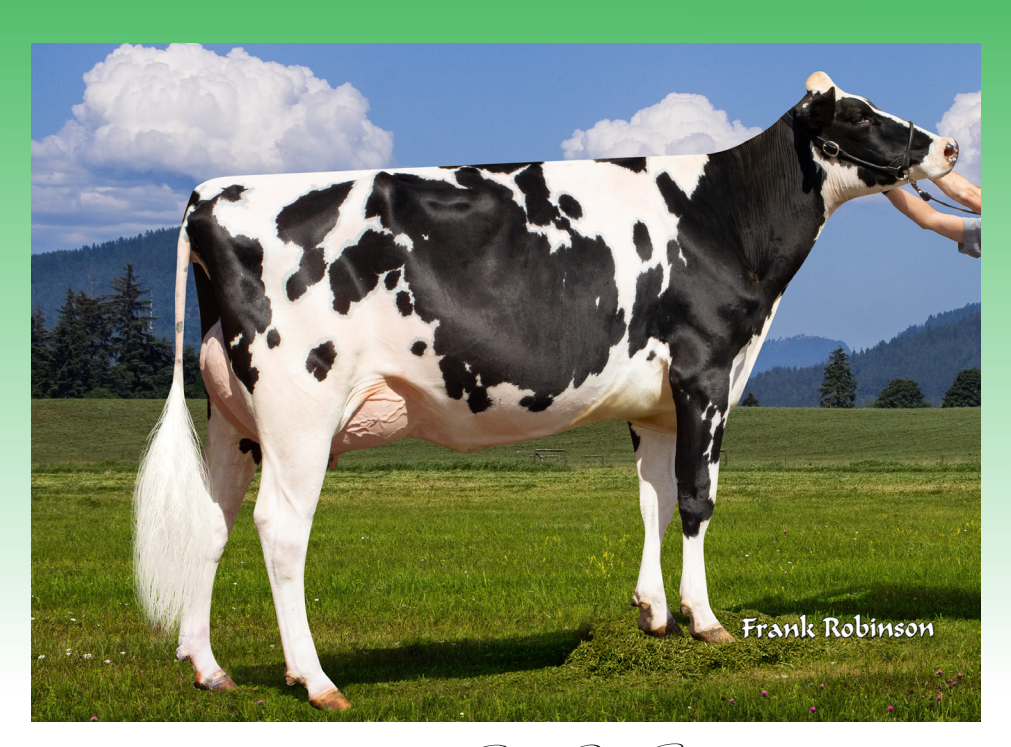
Sidahl-KH Rise M Shine Donor with Rasberry Futures