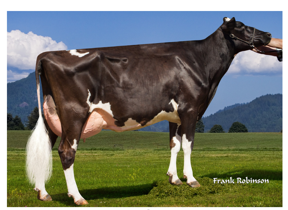
Roylane-KH Jango Rass EX-92 Donor with Rasberry Futures

To view a list of donors and follow along with their success, visit the Rasberry Futures Breeder Page on our website at HolsteinPlaza.com/Rasberry-Futures-LLC.