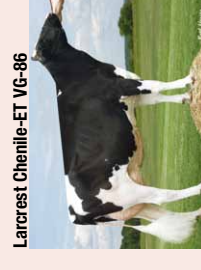
Larcrest Chenille-ET VG-86