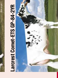
Larcrest Comet-ETS GP-84-2YR