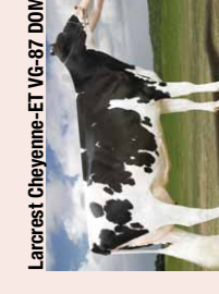
Larcrest Cheyenne-ET VG-87 DOM