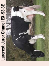
Larcrest Juror Chanel EX-93 3E