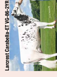
Larcrest Carabella-ET VG-86-2YR