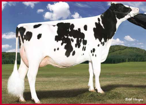
Larcrest Crimson-ET VG-89-USA DOM

One of the greatest Shottle daughters with numerous high sons!