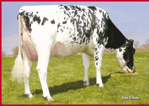
Larcrest Cosmopolitan VG-87-USA DOM

One of the greatest Shottle daughters with numerous high sons!