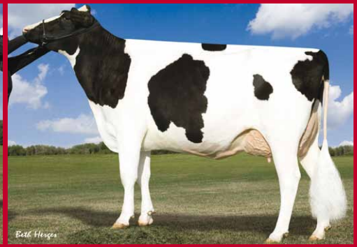
Larcrest Chenoa-ETS VG-86-2YR-USA

The breed's largest Ramos and #22 GTPI Cow on Locator List!