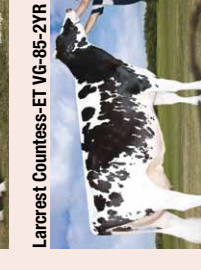
Larcrest Countess-ET VG-85-2YR