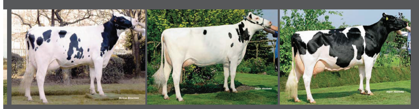
Remarlinda EX-90 Prod: La1 305d 12.899kgM 4.0% 520kgF 3.6% 463kgF La2 298d 14.843kgM 3.9% 585kgF 3.3% 496kgF

K&L Romina VG-87 Prod: La1 305d 11.599kgM 3.75% 435kgF 3.42% 397kgP LW 135