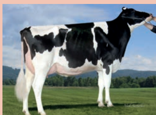
Our-Favorite Unlimited EX-92-MAX