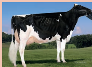
Our-Favorite Endless VG-87-2YR