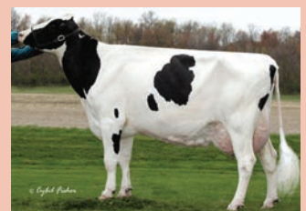
Our-Favorite Conceited EX-92 GMD DOM