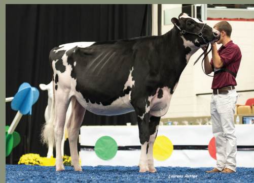
Butlerview Doorman Class VG-88-2YR-USA HM All-American Spring Calf and Res Jr All-American Spring Yearling Dam of the highest PTAT Camomile, MD-Maple-Lawn Caroline +3.96T