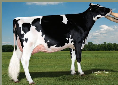
Butlerview Doorman Cassy VG-87-2YR-USA Doorman daughter of Camomile and No. 22 PTAT Cow in the U.S.