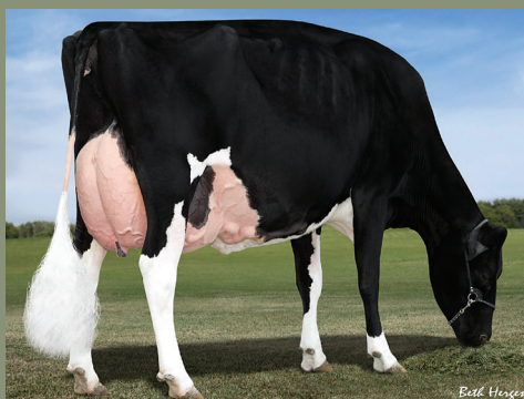
Silvermaple Damion Camomile EX-95-USA Brood cow extraordinaire