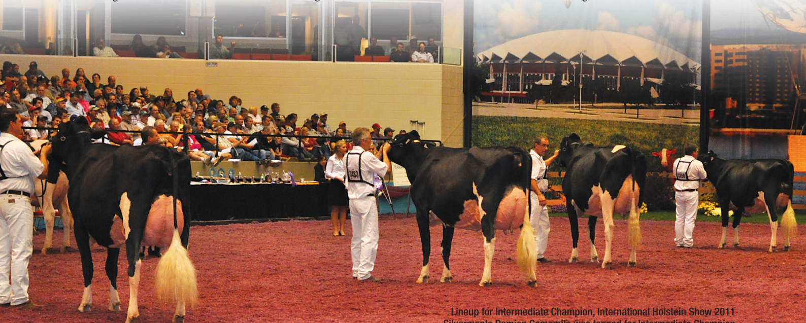
Lineup for Intermediate Champion, International Holstein Show 2011 Silvermaple Damion Camomile was tapped for Intermediate Champion