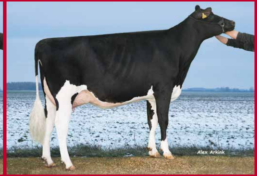
Cashcoin Sharon N.C. The Cashcoin granddaughter of Sheray, dam is Twin Sheray 2