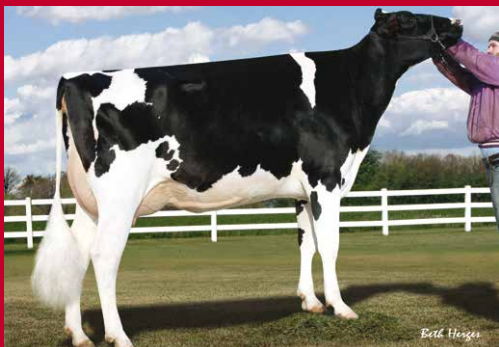
Nova-TMJ Golden Edie VG-87-USA DOM The Goldwyn daughter of Eroy with a dominant U.S. branch