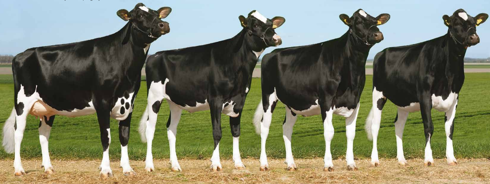
Twin Sheray 2 VG-85-NL Sheray 2 and progeny

"She has brought more people to our herd than any other cow has ever done."