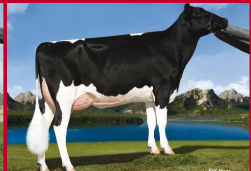
Miller-FF Ssire Exotic VG-86-USA DOM Four offspring over GTPI+2700