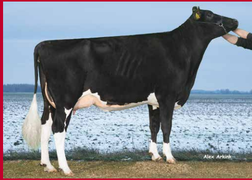
Super Shaney N.C. Top 15 GTPI Cow in Europe 12/15 The Supersire granddaughter of Sheray, dam is Twin Sheray 2