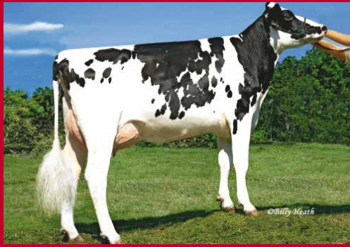
UFM-Dubs Sheray EX-90-USA DOM The matriarch for several of the high-indexing Eroy lines in Europe