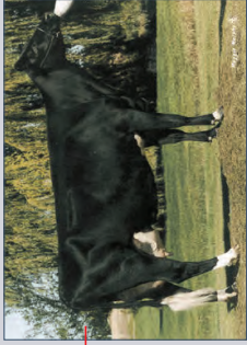
♀ RR Laudan Philadelphia VG-86-DE 2yr. (s. Laudan)