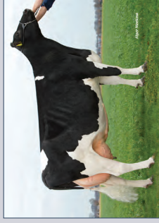
♀ RR Pirella VG-85-DE (s. Stol Joc)