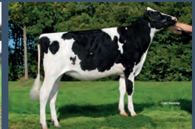
Vekis Paige Sons over 160 RZG and >2500 GTPI already