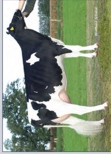
♀ RR Phantasi VG-85-DE 2yr. (s. Hartline Titanic)