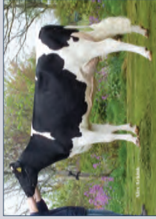
♀ RR Perle VG-87-DE 2yr. (s. Hartline Titanic)