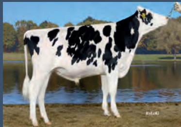
Dacor @ Rinder Allianz #2 RZG Danillo son