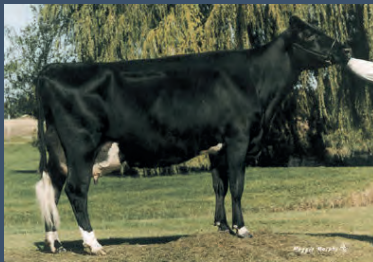
El-Dor Saber Pansy EX-95-USA The American foundation cow of the family