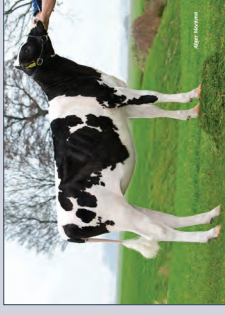
♀ RR Panama GP-84-DE 2yr. (s. End-Road Beacon)