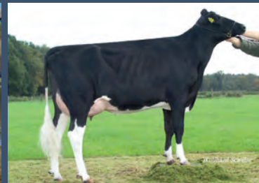
Panama VG-DE 2yr. Dam to an impressive outcross line at Reinerman