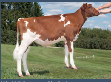
MS M-P Dak 4777 Pie-Red Sold for $ 122.000 in the World Classic Sale 2012