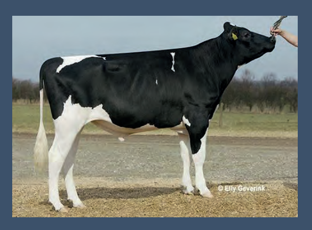
VH Tirsvad Grafit is the Goldwyn son of Tirsvad Oman Neblina. He is the #1 dtr proven NTM bull in Scandinavia and the #1 GLPI & #3 Goldwyn son World Wide based on more than 200 milking daughters.