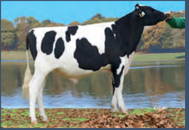
Lexington The current #1 RZG bull in Germany, RZG 162