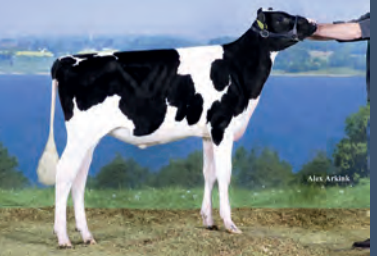
Tir-An Uno Nyala GTPI +2542 & RZG 157. Sold for € 84.000