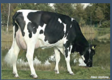
BW Marshall Neblina VG-87-NL 2yr. Important brood cow in the current Neblina family