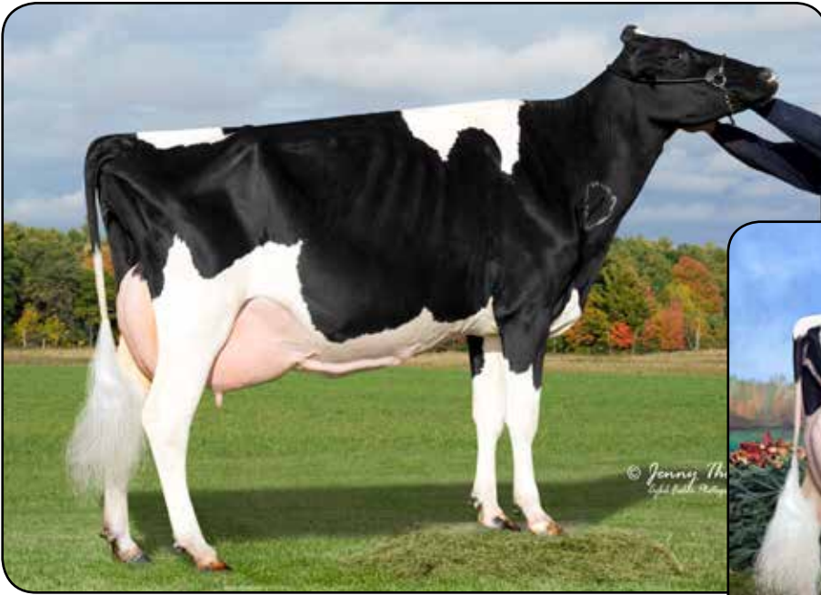
ERNEST-ANTHONY AMBROSE-ET EX-93 2E Dam of Lot 1