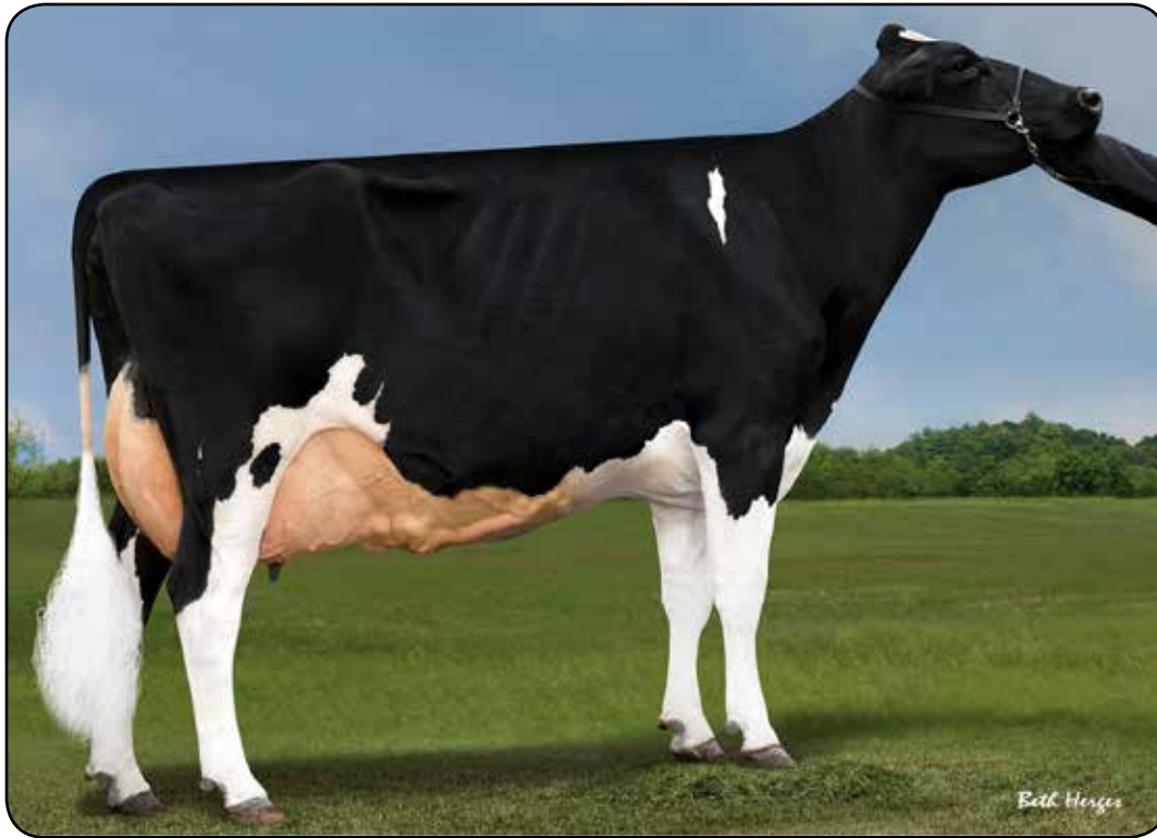
SHANGHIGH-SMIST ATWD WHISK EX-90 Granddam of Lot 25