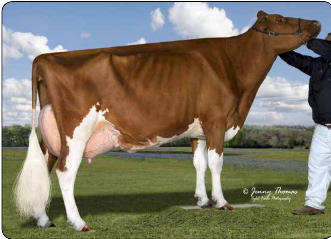
GREENLEA ADV MAEMAY-RED 2E-94 Granddam of Lot 3