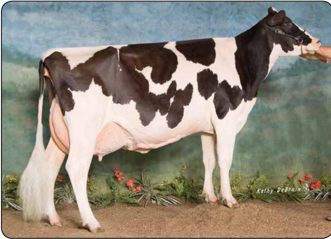
BROOKVIEW-E HHS VALENTINE 3E-93 Granddam of Lot 17