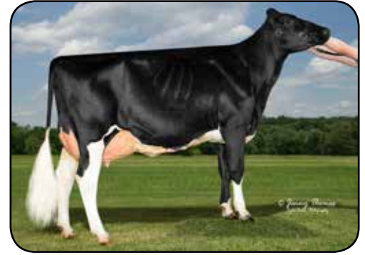
TOPPGLEN WHOAS WHISKEY-ET 2E-92 Full Sister of Lot 14