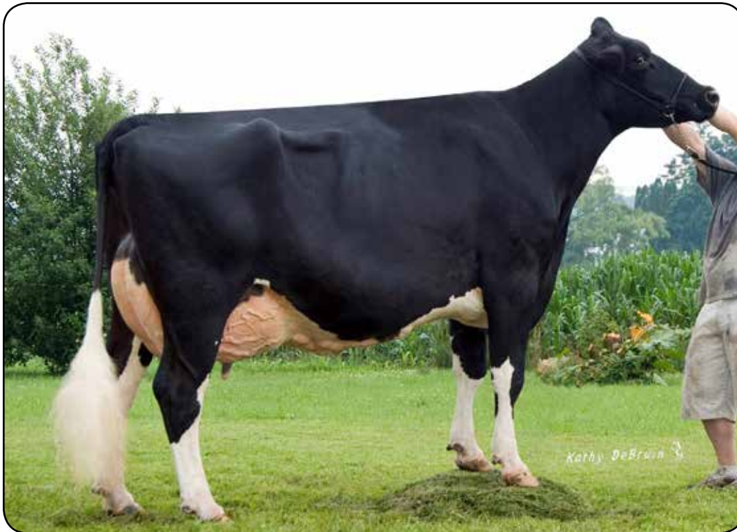
PENN-GATE STORM FLEUREL-ET 2E-94 Granddam of Lot 18