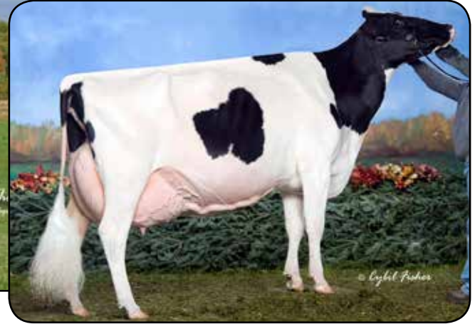
EK-OSEEANA AMBROSIA-ET EX-95 3E Granddam of Lot 1