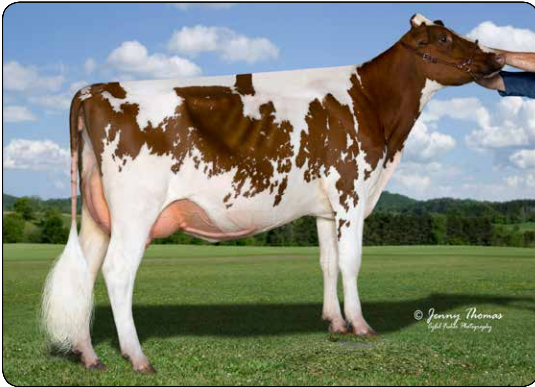
FUTURAMA LARS HAVANA-RED-ET VG-87 Granddam of Lot 24