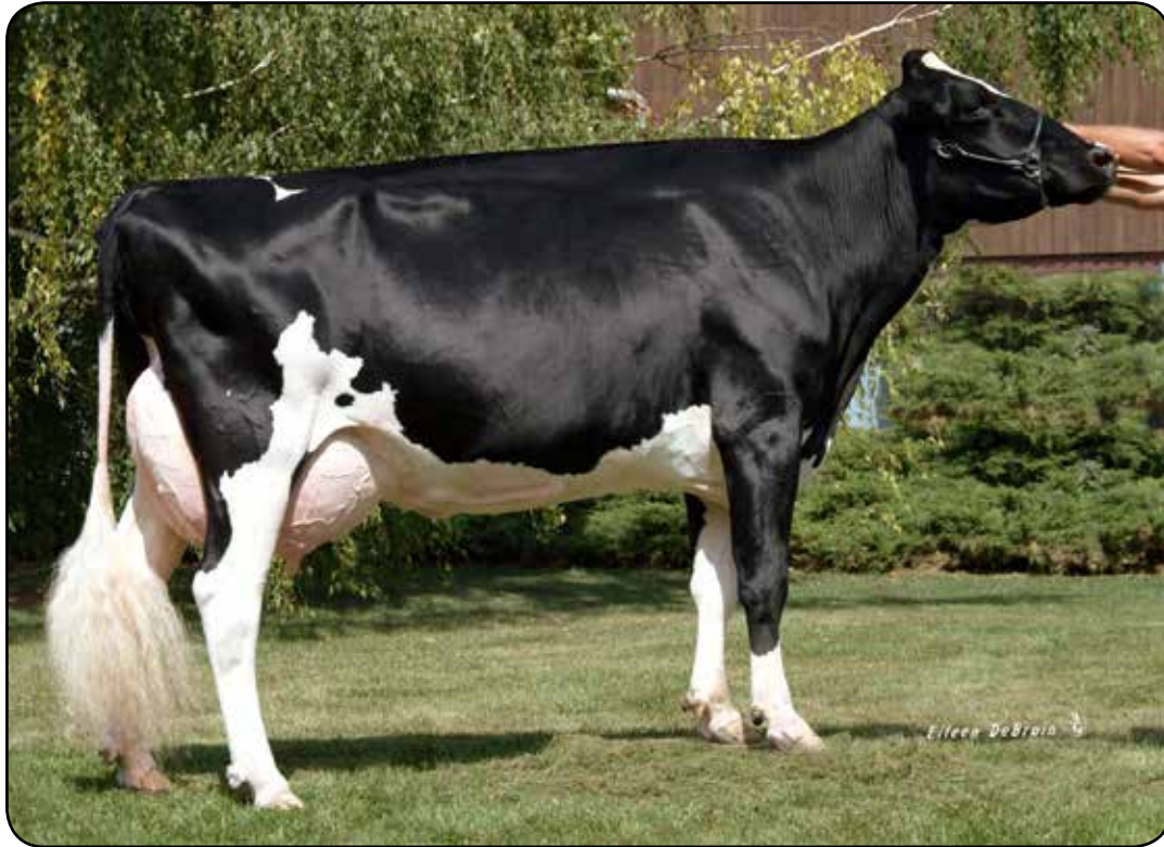
NEW-VISION RUBENS TORY EX-92 Granddam of Lot 19