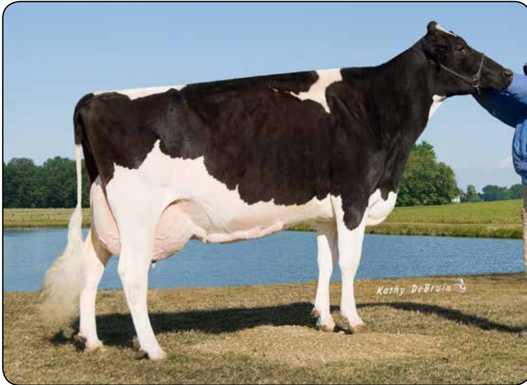
MILEY ROY LEE MAISIE 3E-94 Granddam of Lot 6