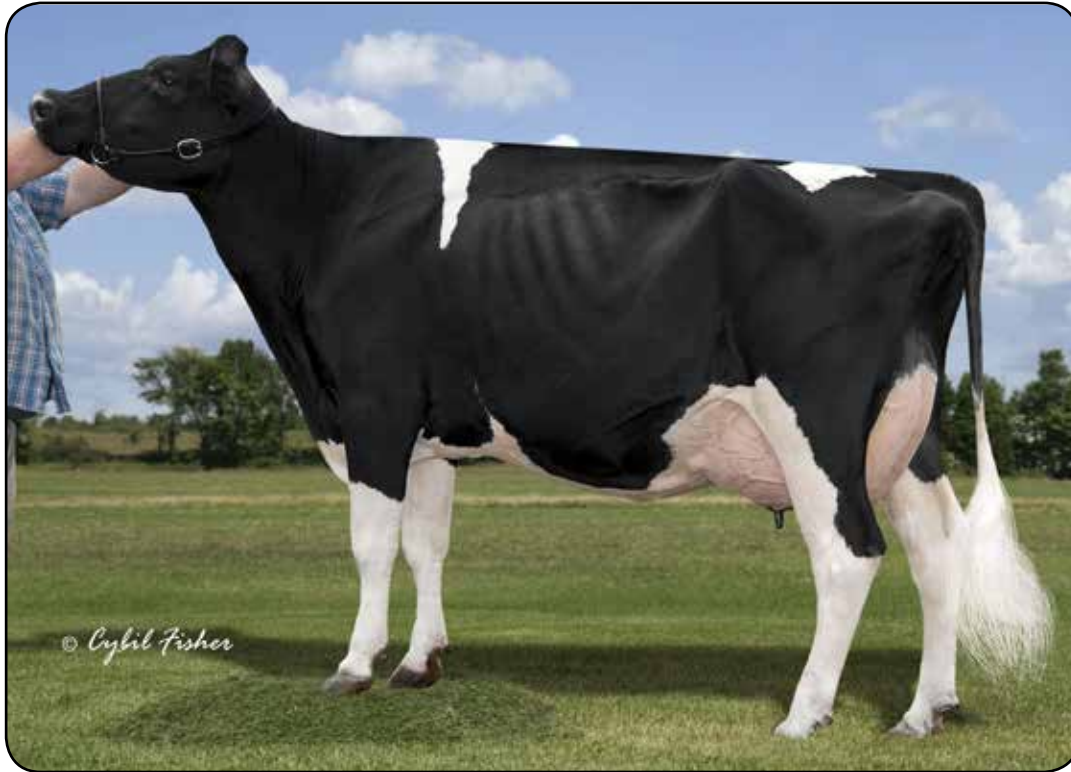
MARKWELL DURHAM DAWN-ET 2E94 Granddam of Lot 32