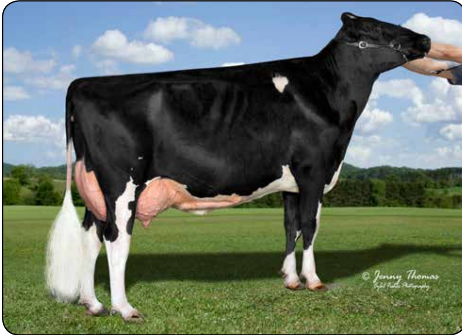
TOPPGLEN ALEXANDER WHOA-ET 2E-93 Dam of Lot 14, Maternal Sister to 11 & 12 & 3rd Dam of Lot 15