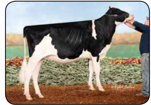
TOPPGLEN ATWOOD WINNER-ET 2018 Jr. All-American Winter Yearling Nominee Maternal sister to Lots 11 & 12 and Whoa