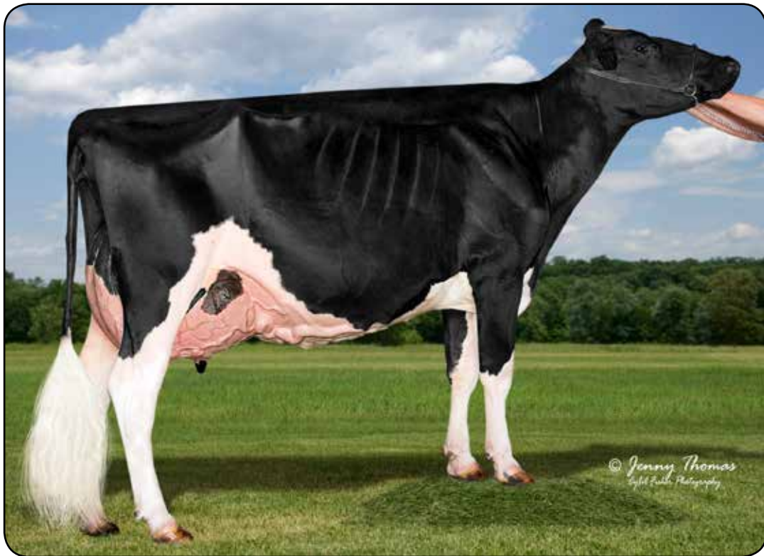
BUCKS-PRIDE GOLD CHIP WINIE EX-94 Dam of EMBRYOS