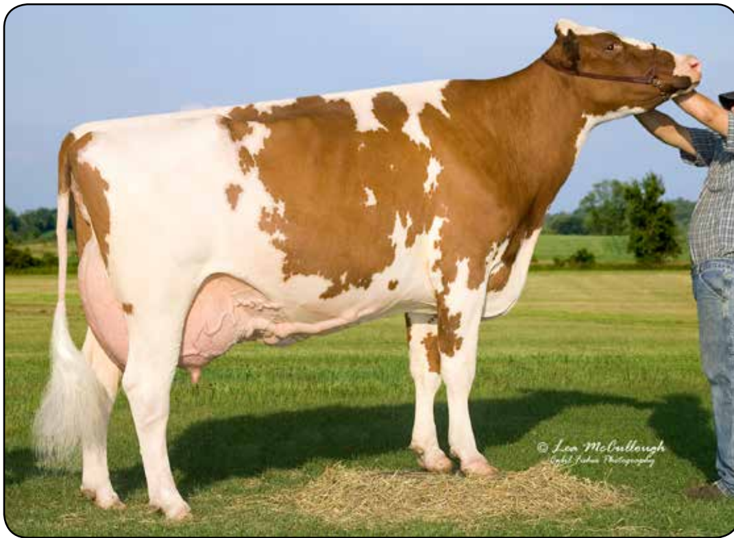
SCIENTIFIC GRACE-RED-ET EX-91 Granddam of Lot 2